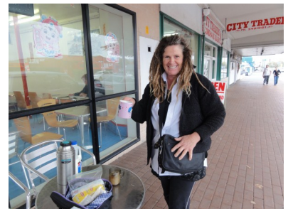
Waste Casper funds on a cup of tea? Not our Deb—she finds a table at a café in the main street and makes her own tea .